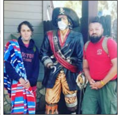
Troop 722 - Vista at Camp Emerald Bay in Catalina, CA