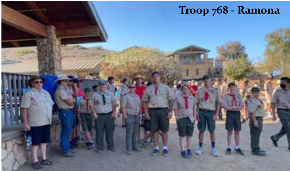
Troop 768 - Ramona