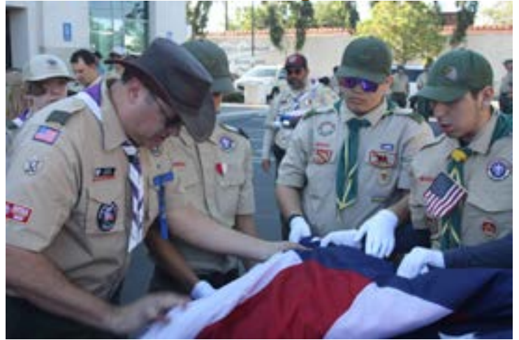
Troop 669 & 1669 at Escondido Veteran's day parade.