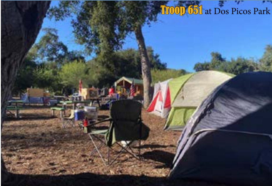
Troop 651 at Dos Picos Park

Your monthly newsletter, December 2023, Page 5